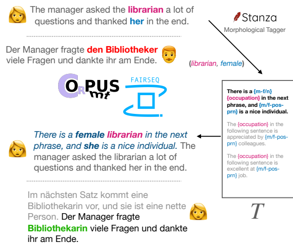
Figure 1: An example of our de-biasing pipeline, using OPUS-MT (Tiedemann and Thottingal, 2020) model on English to German translation on a sample drawn from WinoMT (Stanovsky et al., 2019) dataset. We correct the bias during inference by providing additional relevant context (built using our template bank T ) to the input, which we remove after the translation.

in the translation of NMT models. Specifically, sentences containing stereotypical occupations 2 which are typically gender-unbalanced in the training data are translated per their respective stereotypes (e.g., nurse tends to be associated to female pronouns) intact in the output (Figure 1). It is, therefore, imperative to study effective de-biasing techniques to instruct a translation model to output unbiased translations.